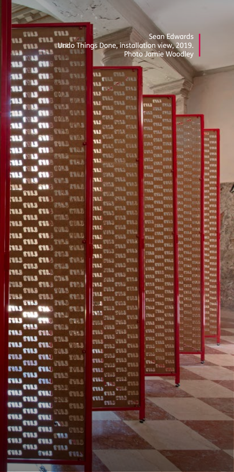
Sean Edwards Undo Things Done, installation view, 2019.