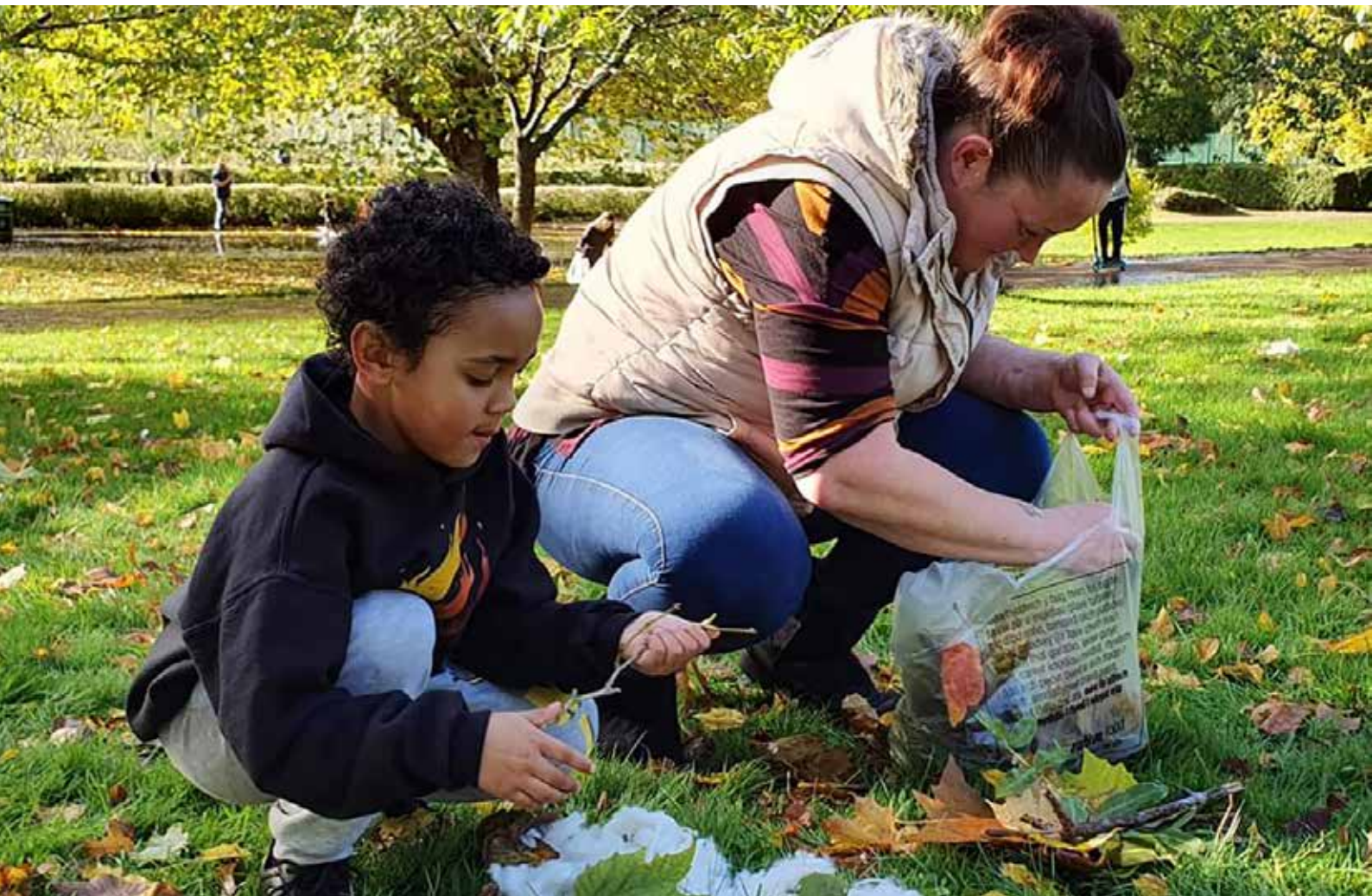
Arty Parky, Bedwellty Park, Head4Arts

This document was written by the Arts Council of Wales . It is an easy read version of Strategic Equality Plan 2020-2024 .