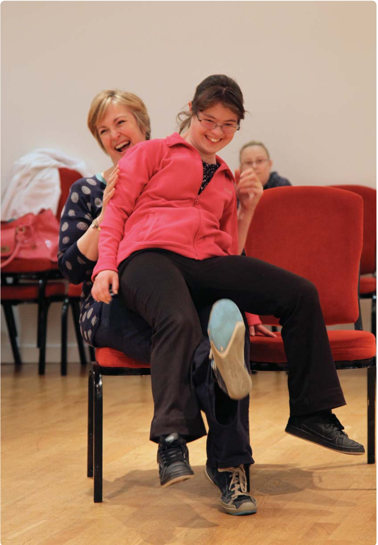
Rise & Shine Drama Group, Disability Arts Cymru