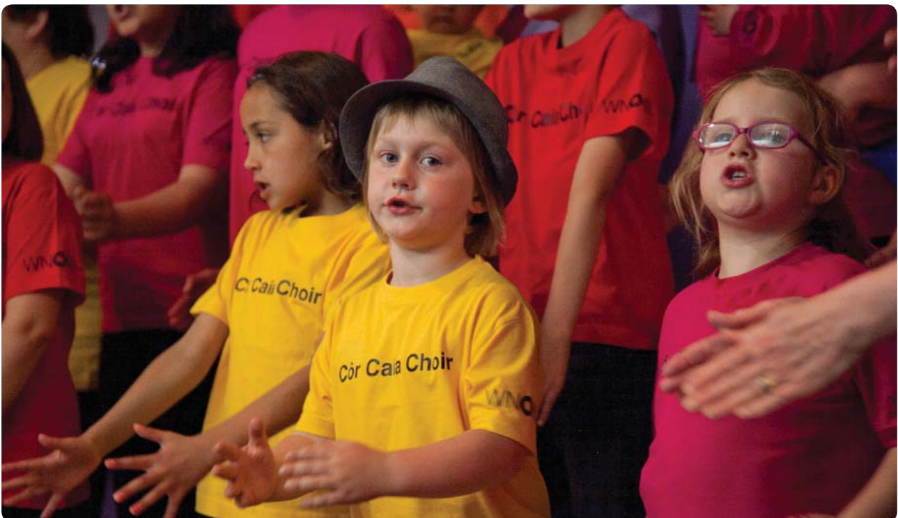
Côr Caia Choir, Welsh National Opera

Wales Millennium Centre provided tickets for people from primary schools in Merthyr Tydfil to attend a performance of the Lionboy and they actually had them on stage with the performers. This was part of their strategy of community engagement.