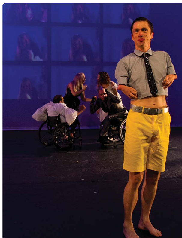
In Water I’m Weightless, National Theatre Wales