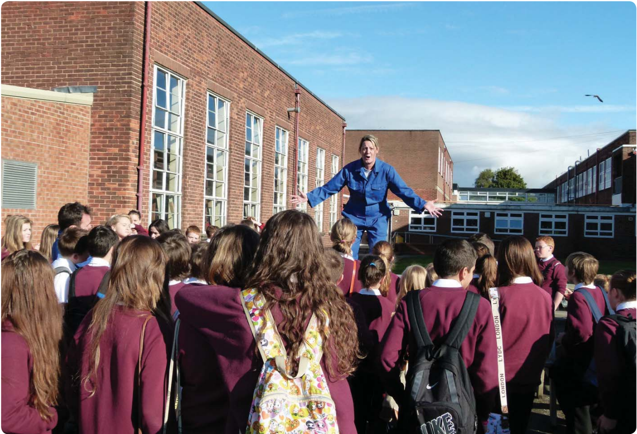
The Hub, Clwyd Theatr Cymru Theatre for Young People performing at a secondary school in Flintshire