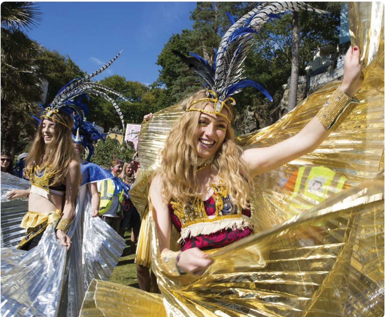
SWICA Carnival, Festival No. 6 2014 at Portmeirion

"A mix of on and offline communication is vital to reaching everyone. You need to look at where people access information locally, as it is different in rural and urban areas and each different area. People still take note of library notice boards and leaflets and local newspapers in rural areas. Mixing with local radio, face to face, social media etc. is important, and remember it is not just young people on social media."