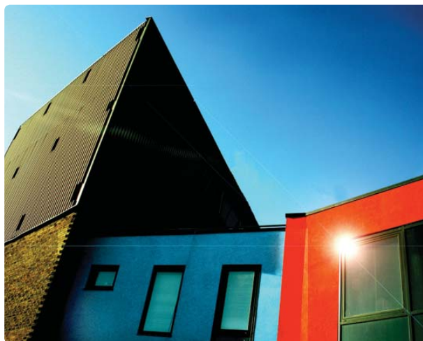
Torch Theatre, Milford Haven

Torch Theatre have a bespoke screening for a local autistic society with higher lighting and reduced sound.