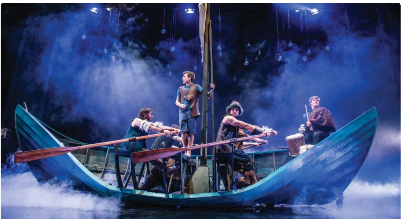
Mordraith Anhygoel Madog, Arad Goch)

Taliesin found that there were issues with trying to get certain individuals to the theatre (e.g. certain groups of women weren't able to take the bus to the theatre as they could not ride the bus with men, for cultural and religious reasons). Taliesin have arranged buses and taxis to bring community members to the theatre (in some cases female only transport).