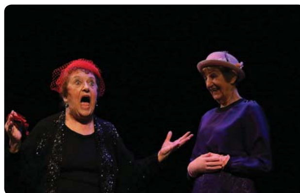
Gwanwyn Festival 2014

Gwanwyn is a Public Arts event celebrating creativity in older age. Wanting to reinvigorate the festival, so it is less stereotypical and more about looking forward (rather than reminiscence or tea dances), they commissioned a Polish photographer who will be examining tattoos of people who are 50+ and see how these have developed over people's lives. They are exploring how true the expression is: "You'll regret that when you're older".