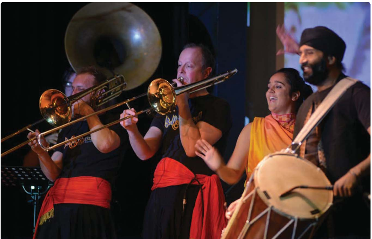
Bollywood Brass Band at Wales One World Film Festival, Chapter

A venue advertised a film as audio described, but when a person with sight loss got there, it wasn't. The venue apologised, got a cup of tea for the visitor whilst they tried to sort matters out. They weren't able to, but they gave the visitor the direct phone number of someone they could speak to next time they wanted to visit. Although initially disappointed, the visitor left feeling that next time they came back there would be more of welcome with the necessary arrangements put in place.