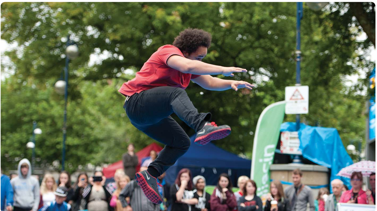
Dance Days, Taliesin Arts Centre

It involves a lot of different groups, from the dance projects Taliesin run to local community groups, to professional dance troupes, all of which have the opportunities to skill-share (especially between professionals, young people and the dance schools).